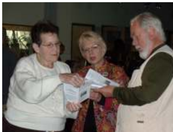
Participants at the "Mythbusters" Workshop, November 18, 2008.