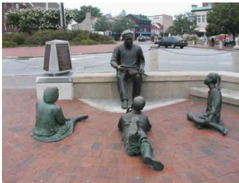
Kunta Kinte-Alex Haley Memorial at City Dock

The online survey polled visitors between October 2004 and June 2005. Most respondents said they were aware of the area because they either 'lived nearby,' or heard about it through 'friends or family.' Historic Annapolis, Annapolis City Dock, and the Naval Academy were visited by half of the visitors to Anne Arundel County. Visitors who stayed overnight were twice as likely to visit the Annapolis Maritime Museum, the Kunta Kinte-Alex Haley Memorial, and the World War II Memorial. As might be expected, sites outside Annapolis were more likely to be visited by overnight visitors than by daytrippers. Visitors' comments indicate there is still much work to be done, however. First-time visitors noted some difficulty in finding or accessing the historic ambience they expected. Four Rivers is developing a history explorer's guide to specifically address this issue; look for it in the spring!