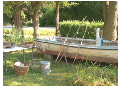
Galesville Heritage Museum Maritime Display